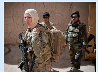
Above: An American female medic from the 82 nd Airborne Division’s 1 st Brigade Combat Team serving in today’s Army.