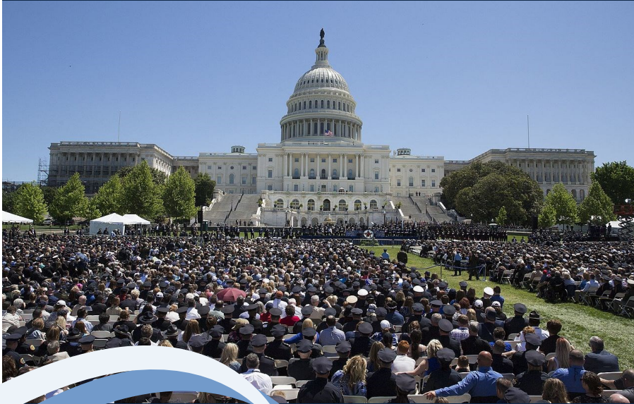
National Peace Officers Memorial Service in Washington, DC on May 15, 2017