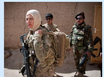
Above: An American female medic from the 82 nd Airborne Division’s 1 st Brigade Combat Team serving in today’s Army.

IN WAR, THERE ARE NO UNWOUNDED SOLDIERS.